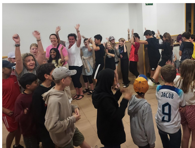
Singing together before saying goodbye to the school in Artes