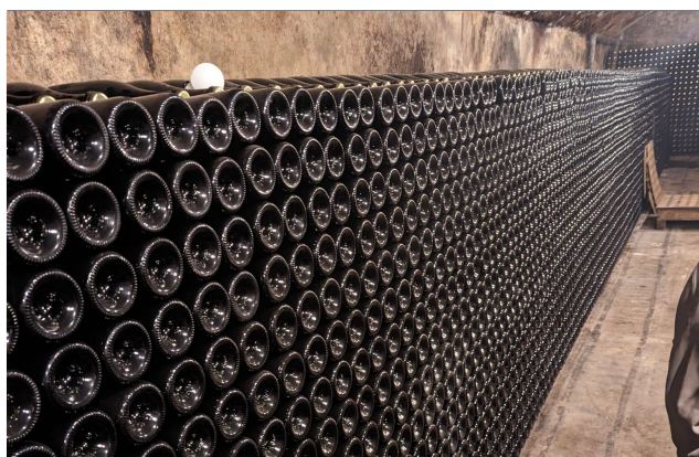
The tour of the Winery