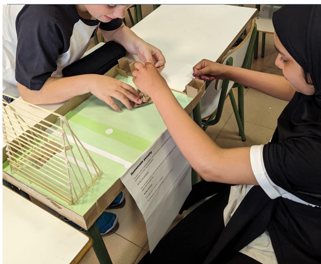
Classroom activities and games