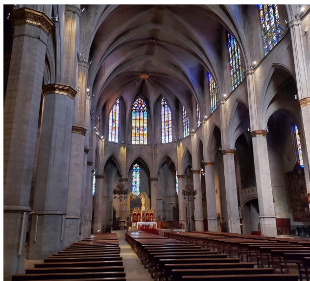
Cathedral in Manresa