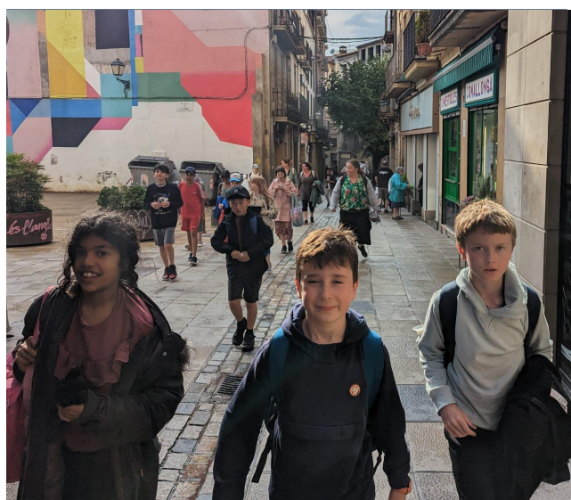
Drying off after the rain on our way to the theatre performance in Manresa