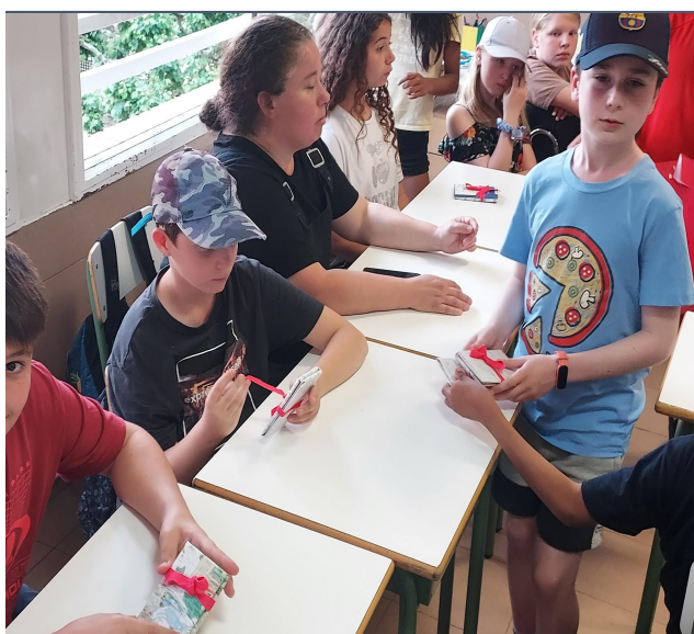
Exchanging gifts between schools