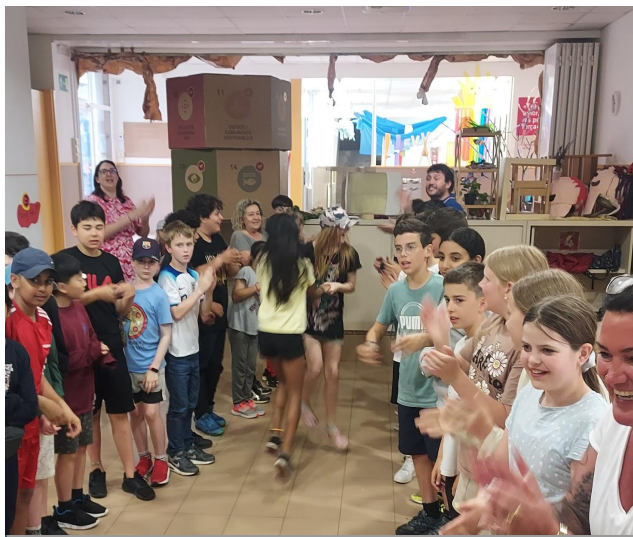
More singing on our last day in Artes