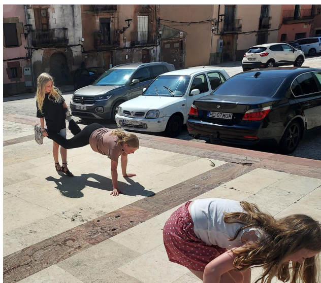
Treasure hunt activity around Artes town