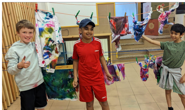
Classroom activities and games