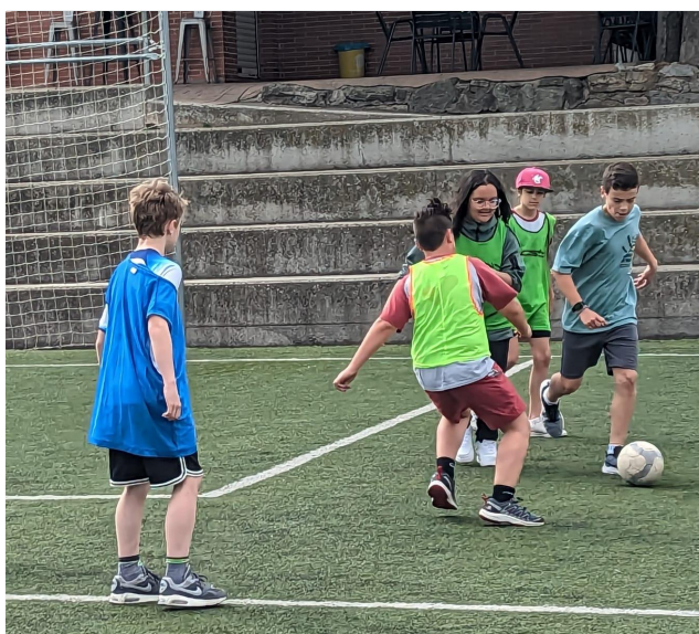
Sports day in Artes