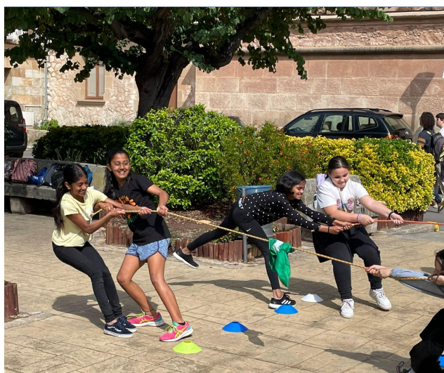
Treasure hunt activity around Artes town

After, we got ready for bed and went to sleep feeling rather exhausted from our adventures that day. When we got out of the pool we had a shower and continued to write in our diaries. To warm us up after the freezing cold dip in the pool we drank some hot chocolate and got changed into some warmer clothes for the evening.