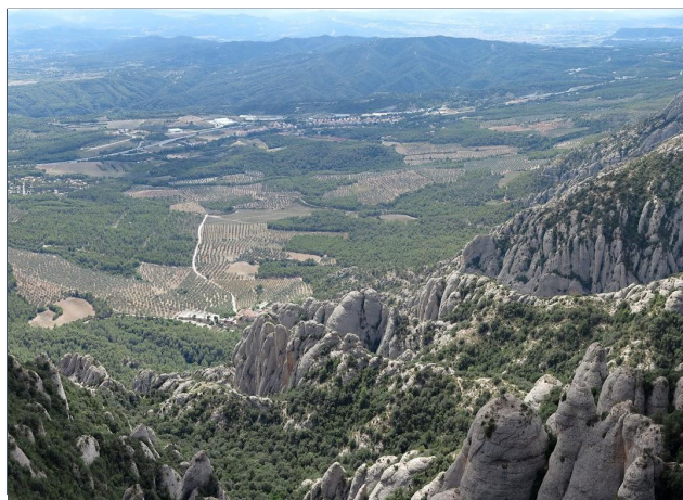
The view from Montserrat

After the talent show we tried Catalan bowling and had dinner. Catalan bowling is a game where you have to throw a small heavy skittle made of wood at some larger skittles to try and knock all but one of them down. After our dinner of traditional Catalan sausage hot dogs we made our way to the place where we were staying. It was a lovely place to stay and the rooms were excellent. Before bed we were given our diaries to start filling out with all our adventures so far and very quickly went to sleep in preparation for another busy day in the morning.