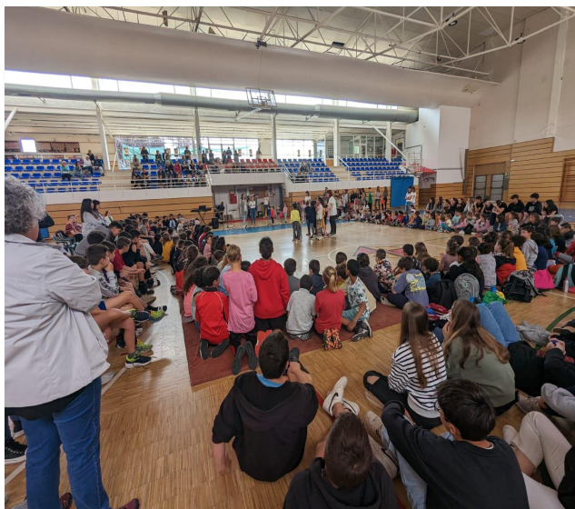
The talent show in Artes' local gym hall