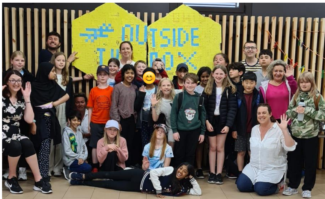
# OUTSIDE THE BOX - The visitors from The UK and Sweden.

We had an early start to our first day. At 3:00 am we travelled to school with our parents. At 3:30 we got on our way to Heathrow airport.