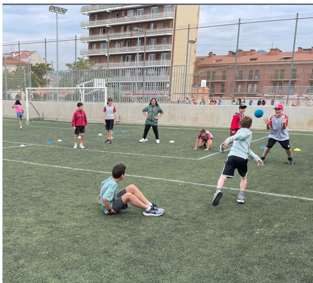
Sports day in Artes