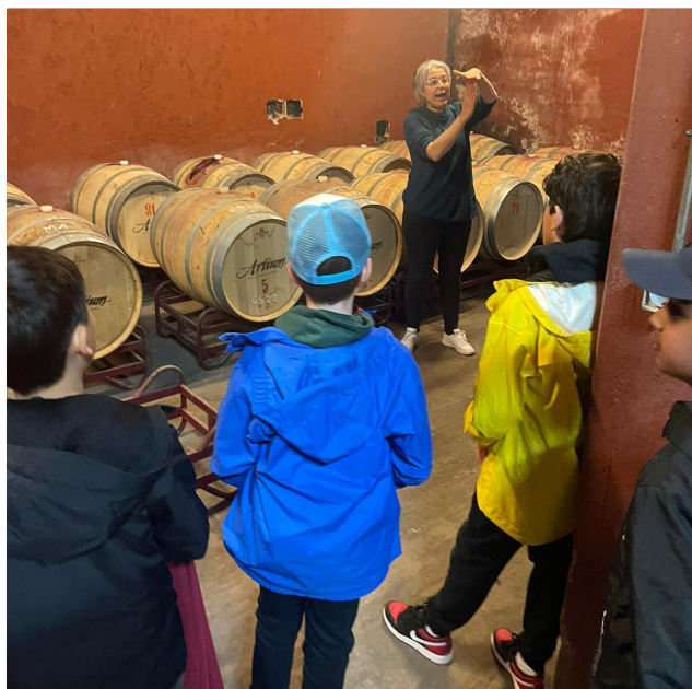
The tour of the Winery