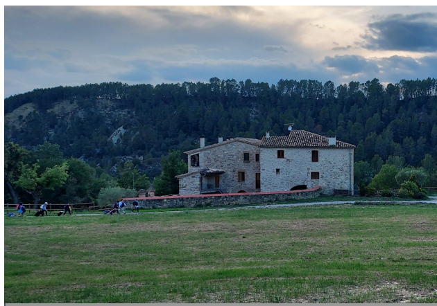
The house the pupils stayed in near Artes